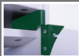
180 Degree nylon hinge for unobstructed collection