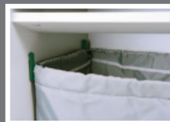
Nylon bag hooks makes bag fit tight. No paper misses the bag.