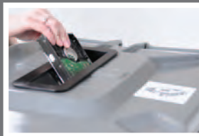
Hard drive cart with Lockjaw® lock and label (shown left)