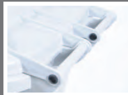
Handles allow for full control when moving cart