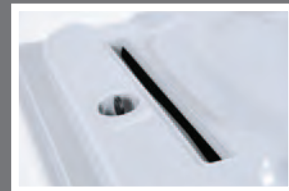
Lid with molded paper slot