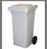
120L cart also available